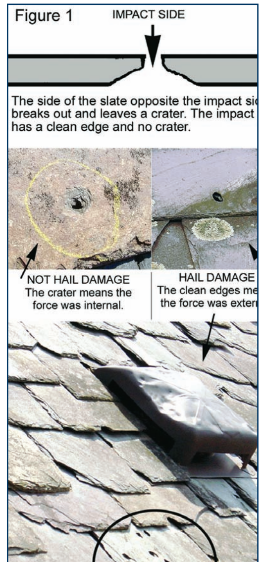
Figure 1 - When slate is perforated, the impact leaves a clean hole on the impact side and a cratered hole on the opposite side of the impact.

Another way to assess the amount of hail impact on a roof is to examine the metal components for indentations. For example, Figure 2 illustrates hail impact indentations on low-slope copper roofs after severe hail events. These roofs are in New Orleans and Chicago. Figure 3 illustrates hail damage to a graduated slate roof in Indianapolis. Although the slates were 1/2 in to 3/4 in thick Vermont slates only 75 years old, some were perforated by huge hailstones.