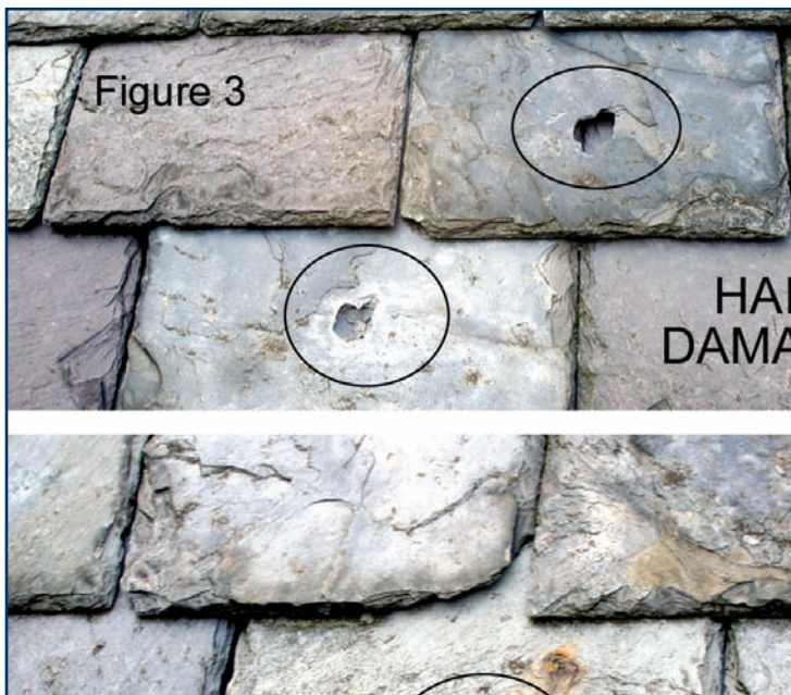
Figure 3 – Hail-perforated slates should simply be removed and replaced. Hail damage rarely justifies replacement of an entire slate roof.