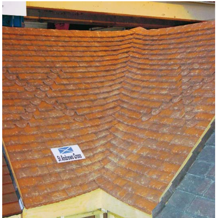
The UK team's laced valley at the World Slating and Tiling Championships, Edinburgh, Scotland (see article, p. 1).