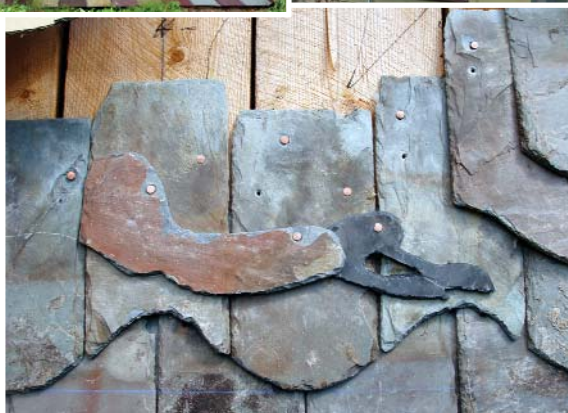
▲ In Progress Completed ►