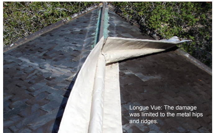
Longue Vue: The damage was limited to the metal hips and ridges.

The slate roof on the Longue Vue House and Garden Museum in New Orleans also suffered damage from Katrina. Installed in