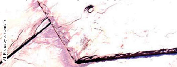
Figure 3: This is what happens to a standard-thickness slate over time if an underlying nail head rubs against it — the nail head eventually wears a hole through the overlying slate!

water to the nail hole and creating a hidden leak.