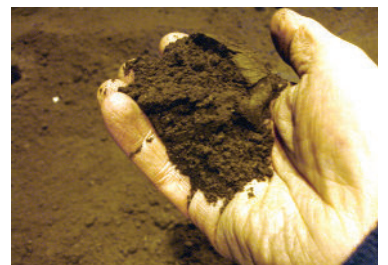
Copper concentrate — the final product of the Erdenet mine. The concentrate is shipped to China for refining.

The good news is that copper is highly recyclable. A million and a half tons of scrap copper were recycled in the U.S. last year, saving 85% of the energy that would have been required to produce new copper from ore. In the United States, about 2/3 of all copper consumed since 1864 has been recycled. So don't throw those copper scraps away! Save them up and cash them in at the scrap yard on a rainy day. ☒