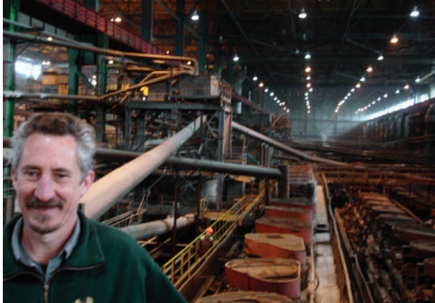
The open-pit Erdenet copper mine in Mongolia,