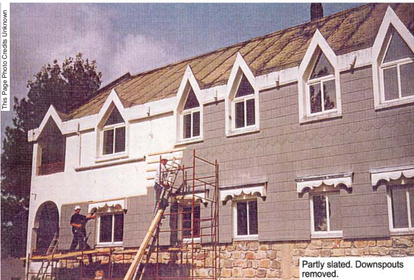
Partly slated. Downspouts removed.