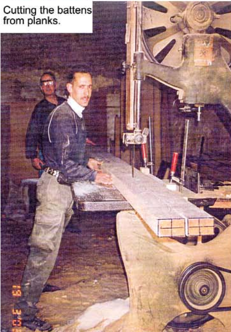
Cutting the battens from planks.