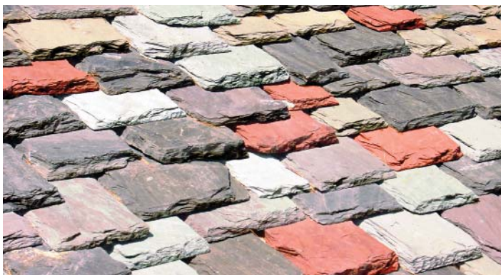
Figure 6: Staggered butt slate roof on the shores of Lake Catherine, Vermont. Slates vary in widths, and lengths, and, in this case, colors and thicknesses. The tops of the slates are lined up but the bottoms are allowed to hang down.

Another method of installing a staggered butt slate roof is to use slates of different lengths. For example, random width and preferably multi-colored slates that are 16", 18" and 20" long can be nailed so that the top edges of all of