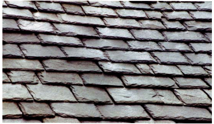
Figure 3: Random width slate installation in the UK.

when the roof slope drops toward 4:12 (which is minimum slope for slate roofs). Insufficient headlap can lead to roof leakage (although a two-inch headlap is common on older roofs with adequate slope — 12:12 or greater).