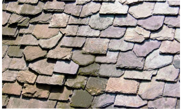
Figure 7: Ragged butt slate roof in Lake Forest, Illinois. Slates vary in widths, lengths, colors and thicknesses. The top of the slates are lined up, but the bottom is allowed to hang down. The bottom edges are trimmed at random to create a unique look.

the slates line up with the chalk lines. The roof is chalked for the 16" slates with a 3" headlap (a line every 6.5"). The effect is that the bottoms of the 18" and 20" slates hang down two inches and four inches more than the 16" slates. Not only does this create a dramatic staggering effect on the roof, but it also allows for a "ragged" or "battered" butt style to also be utilized, if desired (Figure 9, page 13).