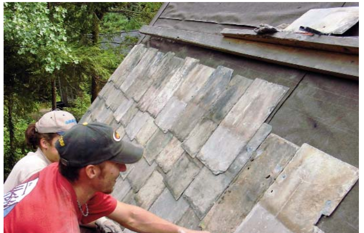
Figure 8: Same length slates, staggered above chalk line, in Sewickly, Pennsylvania (see also back cover).